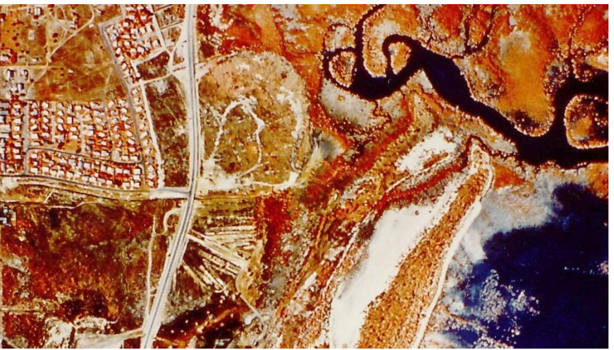
Figure 2 (above): The Ludmilla Dump site in 1984 after rapid expansion in 1975, before the construction of Minmarama Village in 1986-7 and aquaculture ponds in 1997. The original Kulaluk plans were for community sports fields on the land-fill dumps.

Figure 1 (above): The Ludmilla dump site in the 1974 before it was extended further into the mangroves after Cyclone Tracy.