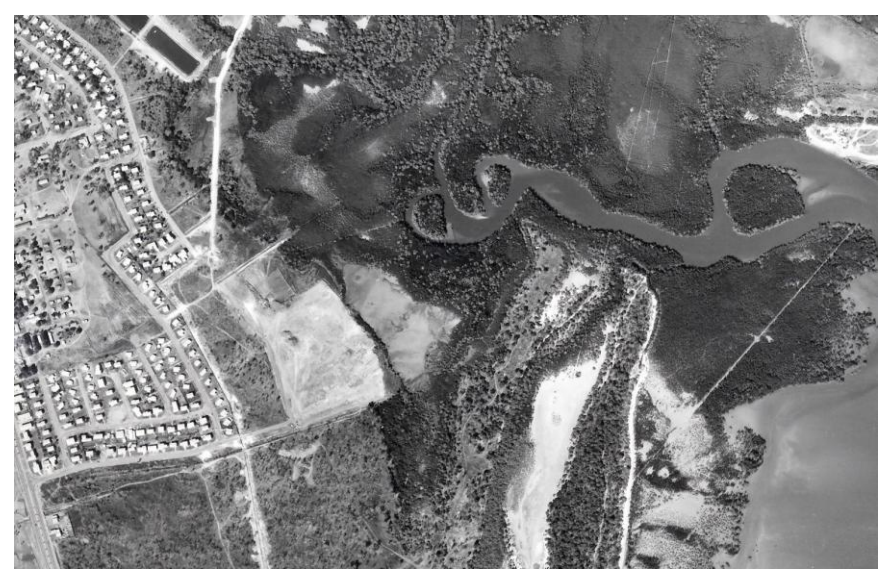
Figure 1 (above): The Ludmilla dump site in the 1974 before it was extended further into the mangroves after Cyclone Tracy.

Considering the above list of concerns of the Minmarama residents, the remaining grievances appear minor. They include a smelly neighbouring sewerage treatment plant and sewerage outlet into the creek, and sandfly and mosquito plagues. In addition, the residents have an ongoing list of complaints regarding the administration of the village by their landlords, the Gwalwa Daraniki Association. The state of the internal roads is a disgrace, while long grass in the wet season provides a hiding place for snakes and mosquitoes and gives a neglected appearance to the village. It is no wonder the residents ask, 'Where does our rent money go?' William B Day, October 2011